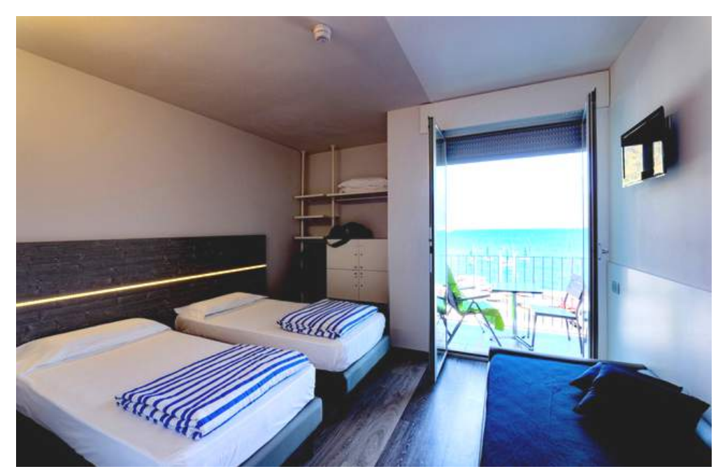
ITALY - LAKE GARDA

You can choose between a simple hostel bed, a single room, a double room, a group room for four or for six, and convenient apartments. Some rooms look onto the lake, others have a splendid view of the mountains. Available with all the appliances: balcony, private bathroom with shower, internet connection, hairdryer, air conditioning, satellite TV.