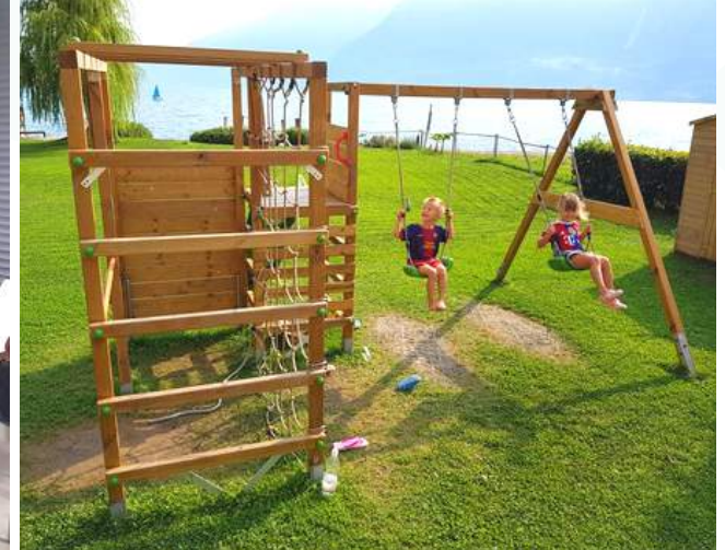
ITALY - LAKE GARDA