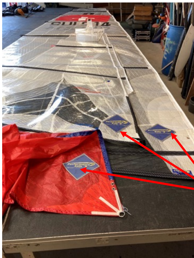
Performance Sails Logos